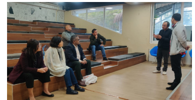
9 th December, 2022 -Visit of Officials from ADB at PRIME Startup Hub Shillong about ongoing projects.