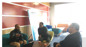
16 th October, 2022 -Visit of Faculty from Nongtalang College, Jaintia Hills at PRIME Startup Hub Shillong.