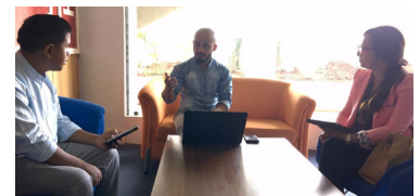
14 th October, 2022 -Visit of Faculty from Williamnagar Government College, Garo Hills at PRIME Startup Hub Shillong.