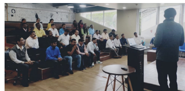
12 th October, 2022- Visit of Officials from MSME Innovation Scheme at PRIME Startup Hub Shillong.