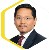
Shri. Conrad Sangma Hon'ble Chief Minister Government of Meghalaya

Katba phi nang kiew iaki mawjam bad ka lynti ia id kum u ne ka nongsengkam lajong , ai ba ka PRIME Pre-Incubation kan iarap iaphi ban pyntyllun da kaba kyrshan ia phi ha ka jingsdang ka kam ka jongphi . Ka PRIME Pre-Incubation ka dei ruh ka virtual (lynba ki kor ki bor) prokram kaba ia pyntyllun haki saw bnai eiei bad ka kynthup ruh iaki jinghikai kumno ban sengkam lajong bad iaki sap ki phong kiba phin ioh na ki training , ki workshop bad ki session naki nonghikai. Ka PRIME Pre-Incubation ka peit khamtam ia kito ki nongsengkam lajong kiba trei lyngba ki jaitkam ba khampher (innovation) lane ia kito kiba dang shu sdang iaka kam hynrei kiba kwah pat ban sngewthuh shuh shuh iaki customers (nongtheid) bad ki jingdonkam haka iew ka hat, ban pynjanai iaka buit treikam khngang ban ioh ban plie paidab iaka kam.